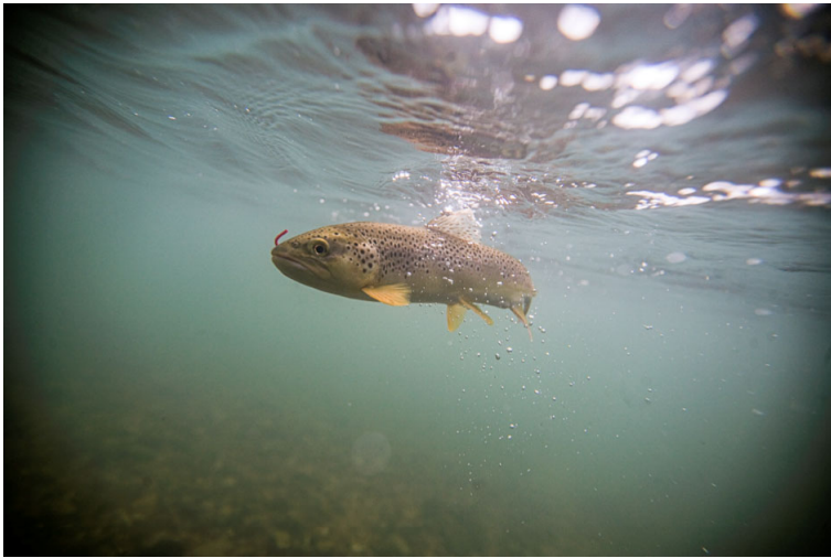
112109 trout fishing-194