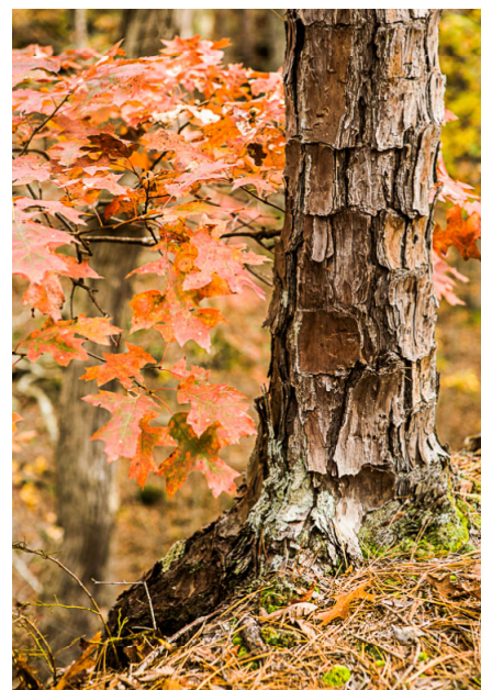
5-102509 hickory canyon-59