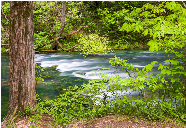
3-051008 Blue Spring NA-87