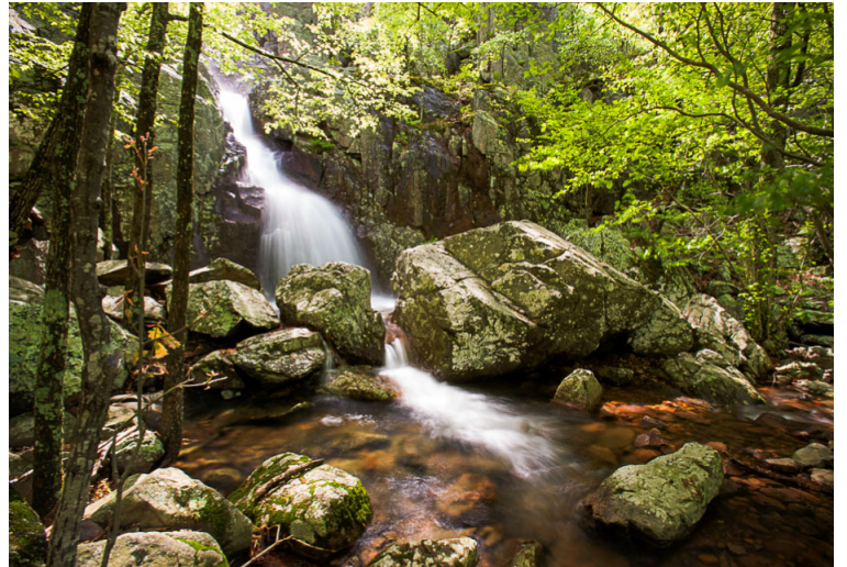
2-050409 Mina Sauk-85