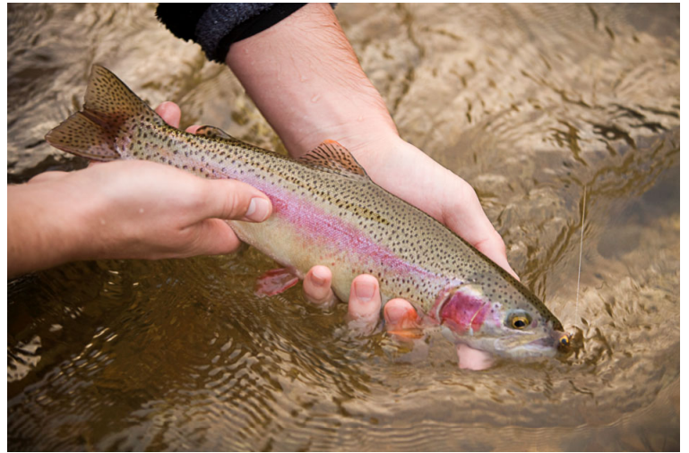
112209 trout fishing-50