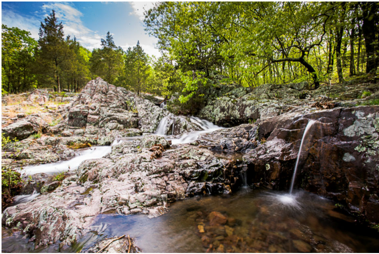
1-050409 Mina Sauk-69