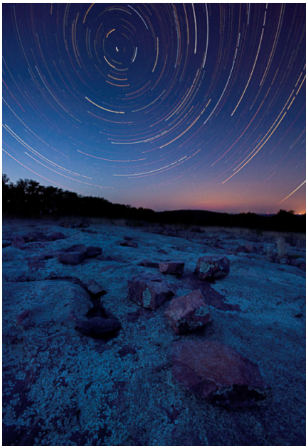
38-startrails master 3 final