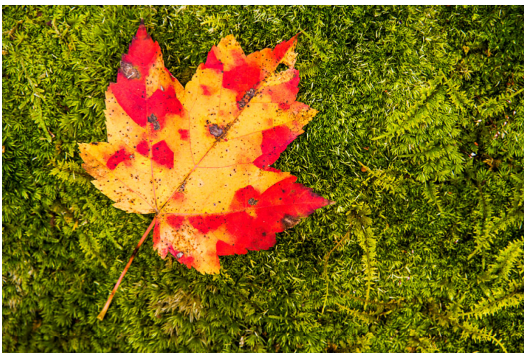
4-102509 hickory canyon-12